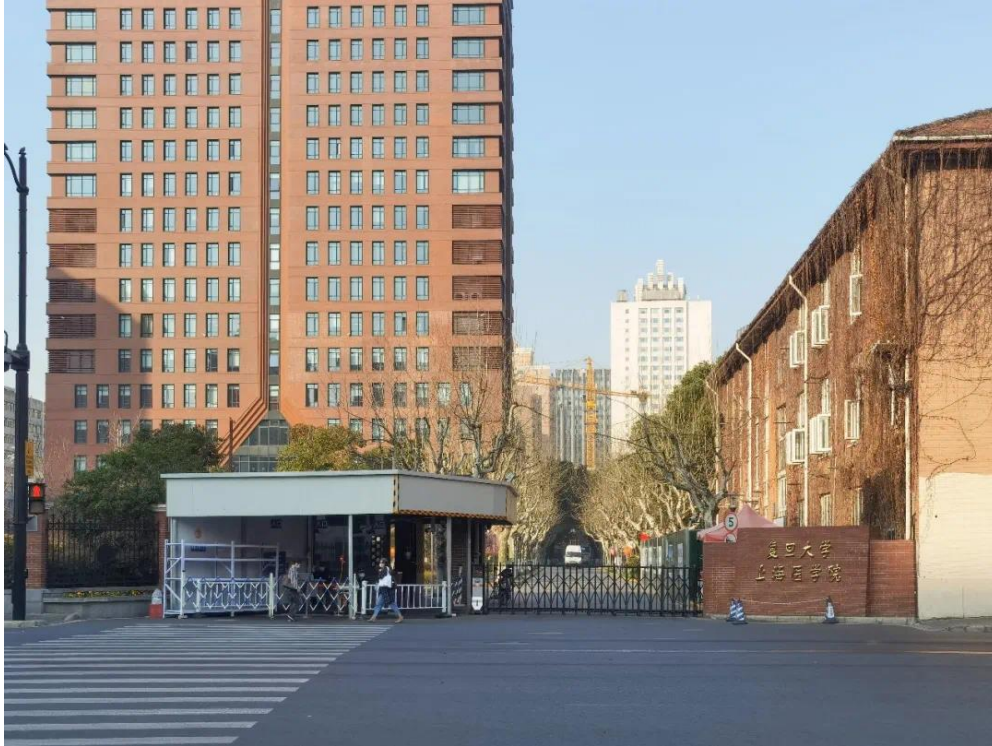
Entrance to the Shanghai Medical College of Fudan University

The School of Public Health is situated in the Shanghai Medical College of Fudan University which is the one of Campus of Fudan University, located in the bustling Xuhui District of Shanghai, adjacent to the Zhongshan Hospital affiliated with Fudan University.