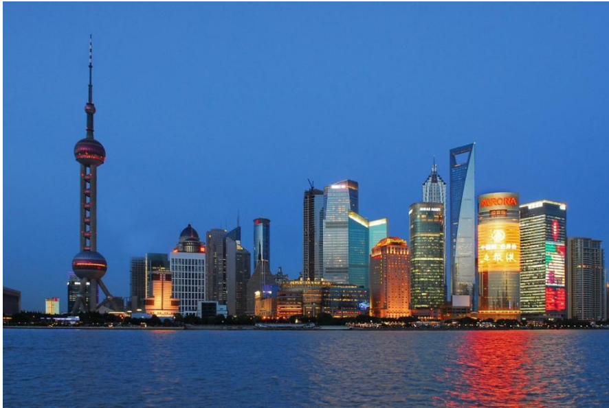
The left one is the Oriental Pearl Tower, a famous landmark in Shanghai.