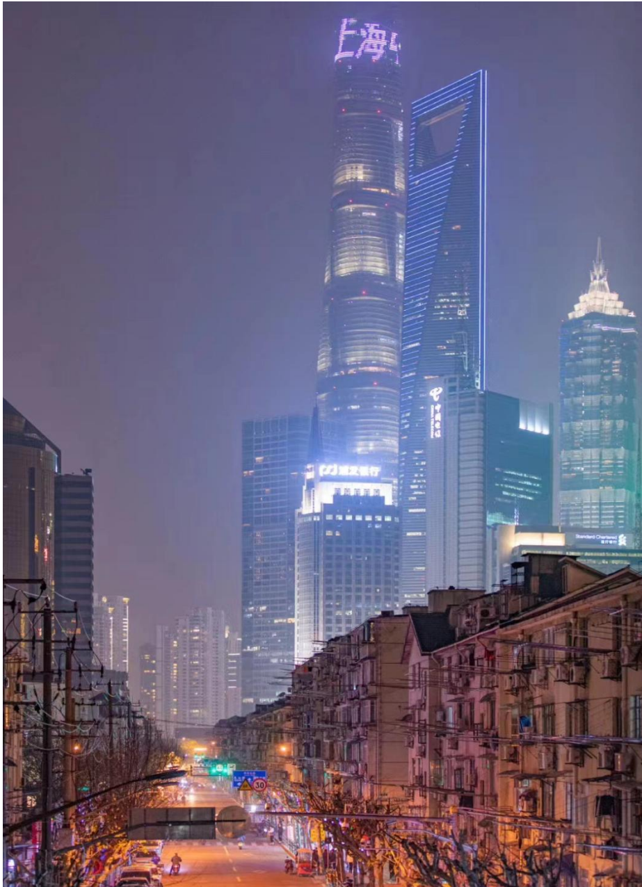
Shanghai's skyline showcases a blend of modern and traditional architectural styles.