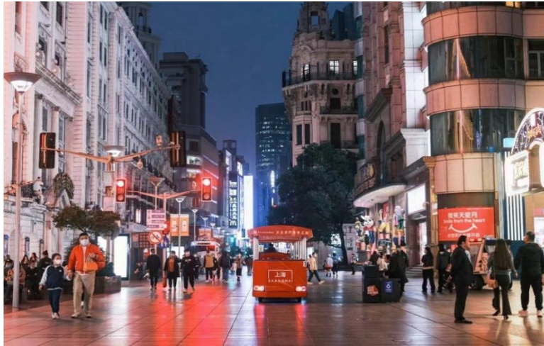
The bustling city center meets all shopping needs.