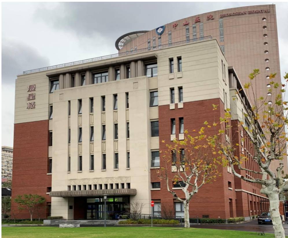
The academic building of the college and the Zhongshan Hospital behind it.