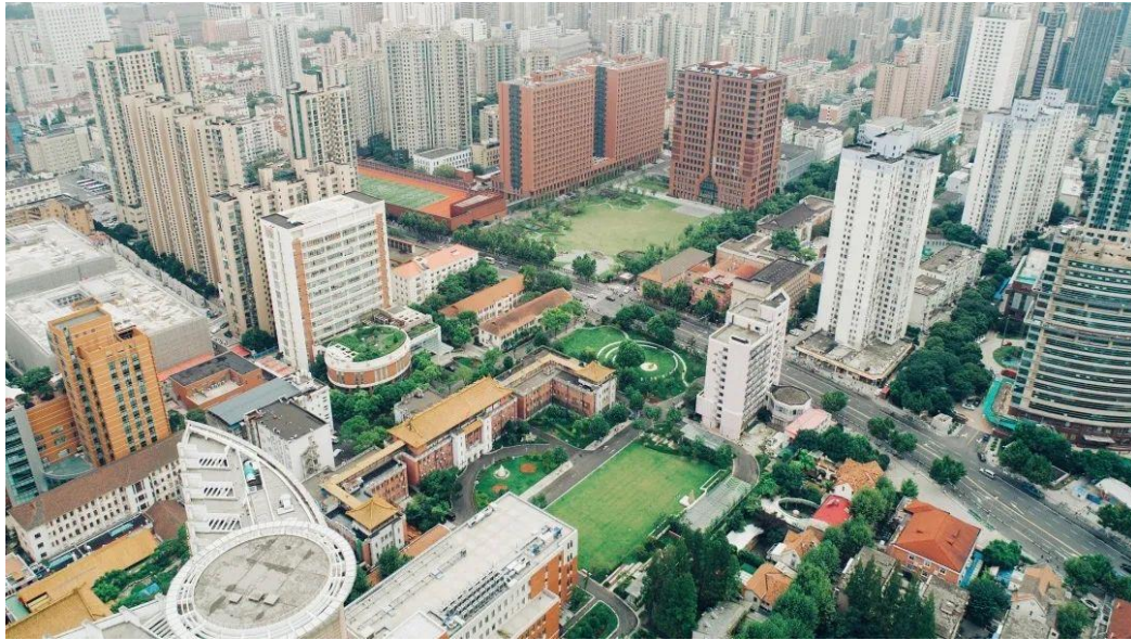
An aerial view of the entire college.