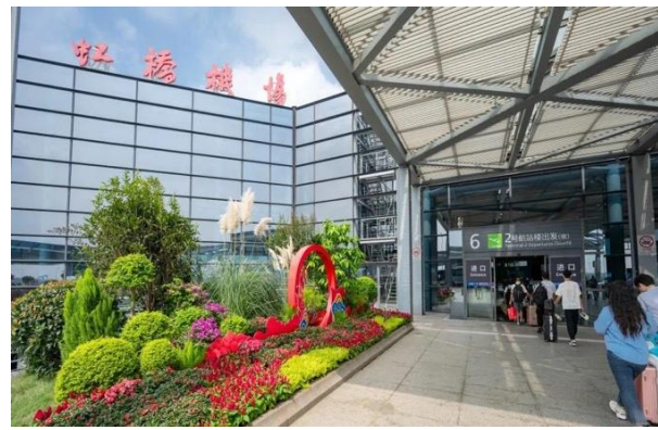
Arriving at Pudong International Airport Arriving at Hongqiao International Airport