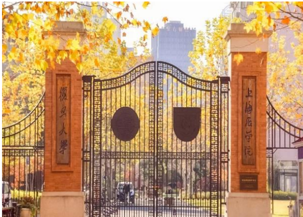
The grand entrance of the college.

At Master's level, the faculty currently hosts one interprofessional international master program – Master of Public Health, which is recruiting students with a broad background and aim to deliver an interprofessional approach to the courses taught.