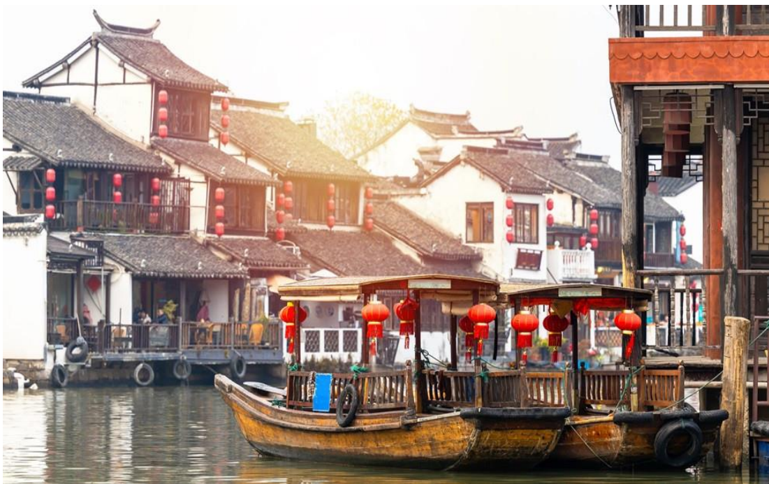
Zhujiajiao Water town (known as the Venice of Shanghai)

Looking forward to seeing you at the U21 Health Sciences Summer School in 2024!