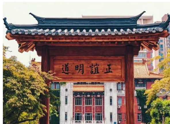
The motto of Shanghai Medical College