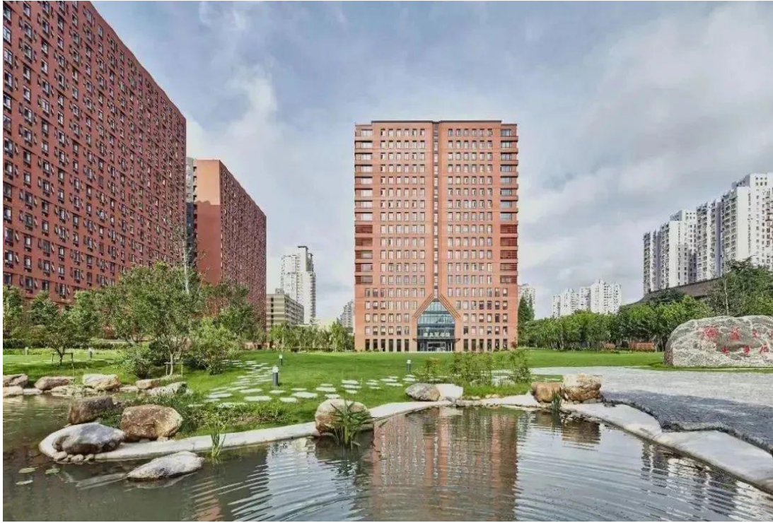
There are excellent facilities which will enable us run a successful Summer School.